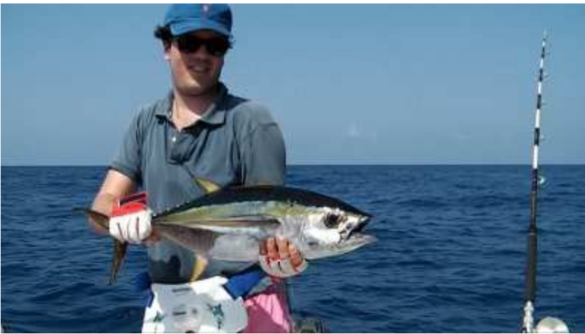
Diner size Yellowfin Tuna